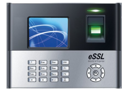
BIOMETRIC ACCESS TIME ATTENDANCE VDP