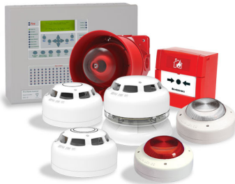
FIRE ALARM SYSTEMS